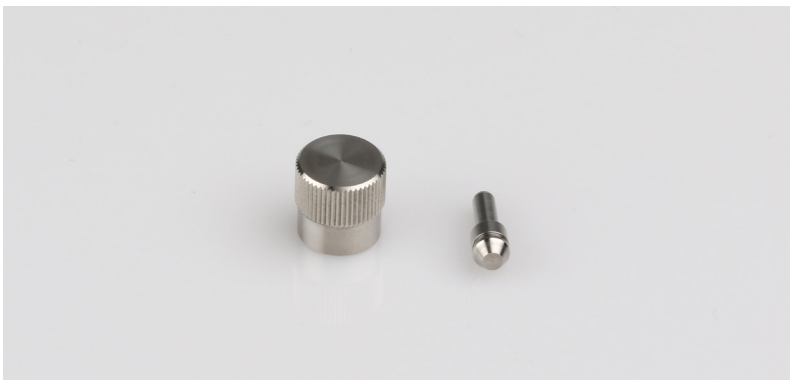
Figure 1: New protection cap with plug.

The new protection cap for the receptacle is two-parted: It consists of a threaded cap and a Ø 2.5 mm plug.