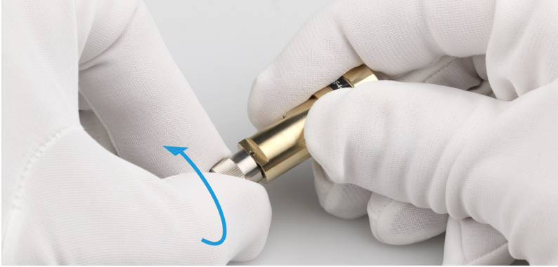
Figure 2: First, remove the threaded cap from the fiber receptacle of the collimator.