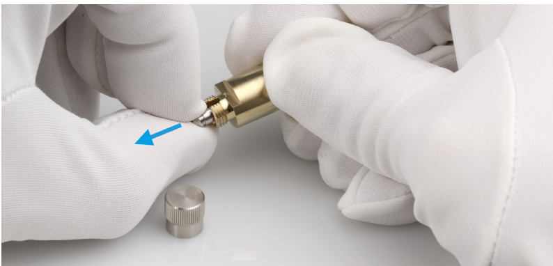
Figure 4: Now, please pull out the plug.