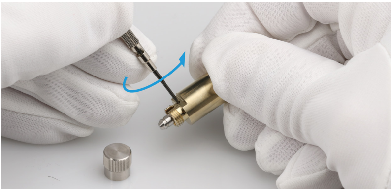
Figure 3: Then, slightly loosen the small pin screw. Use the screwdriver 9D-12. Make sure to not loosen it too far, as it is small and easily lost.