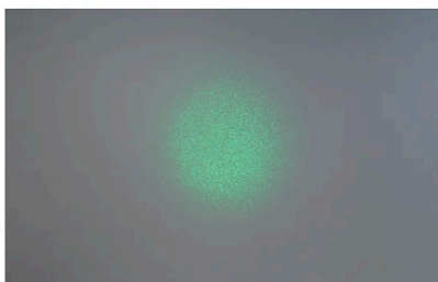
Good multimode beam profile

To avoid this, you can either make the multimode fiber longer (to increase mode mixing as it passes through the fiber) or coil the fiber with a smaller bend radius to increase mode mixing. You can also choose a smaller focal length to have a larger light cone when coupling into the fiber, which in turn excites more modes. Often a combination of these three strategies will result in a stable, "super-Gaussian" beam profile exiting the multimode fiber.